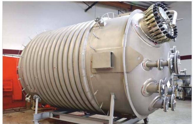
HIGH PRESSURE VESSEL