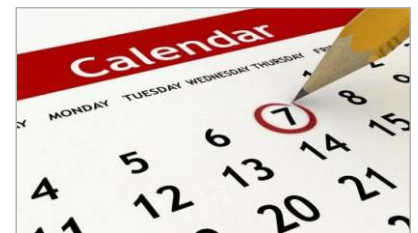
ON TIME DELIVERY