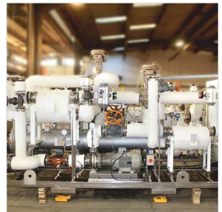
SKID MOUNTAIN PROCESS EQUIPMENT