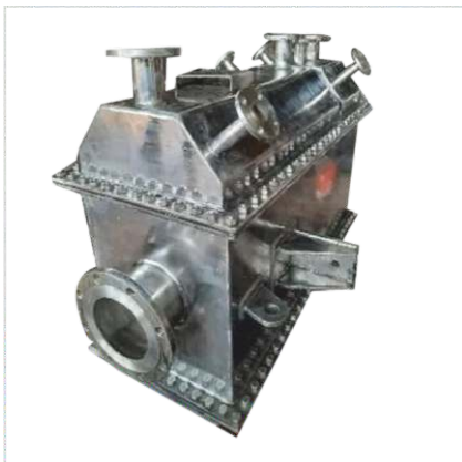
BOX HEAT EXCHANGER